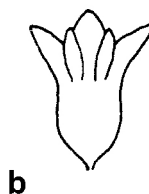
Epicalyx segments. (a) A. mollis (series Elatae ) (b) native taxa.