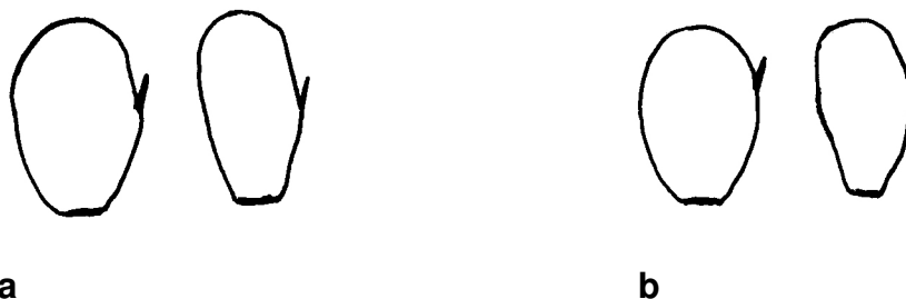
Carpels (a) A. plantago-aquatica , (b) A. lanceolatum .

A. lanceolatum differs from A. plantago-aquatica in a number of characters, of which the floral and fruiting are the most reliable. Leaf-shape is often distinct, but leaves of A. plantago-aquatica can approach those of A. lanceolatum in shape when young or when floating on the surface of the water (see illustrations), and it is unwise to record A. lanceolatum on the basis of leaf shape alone. There seems to be little consistent difference in flowering times. A. lanceolatum is under-recorded, at least in Ireland.