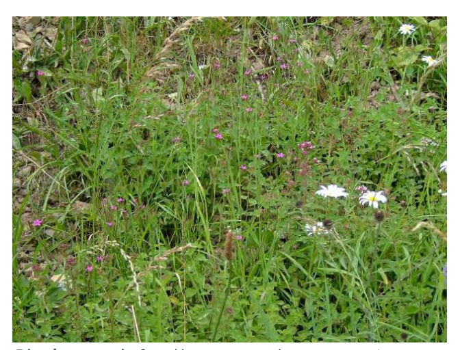
Dianthus armeria , found here as a casual escape on waste ground at Dymond Court, formerly Saltash Station Yard, Saltash, Cornwall.

Plants have a basal rosette of dark green oblanceolate leaves that begin to die-off by the time of flowering. The opposite stem leaves are linear-lanceolate, pointed and keeled with short adpressed hairs (Poland & Clement 2010).