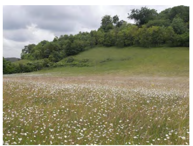
Magpie Bottom, near Otford, Kent, where Euphrasia pseudokerneri grows with Polygala amarella .

The corolla (6-) 7-9 (-11) mm is large for an eyebright, and comprises 4 petals that are fused into 2 lips, with the lower lip deflexed (Yeo 1978; Stace 2010). Stem leaves are dark (-pale) green, stalkless, narrow and (usually) glossy with serrated margins and 5(-7) pairs of acute to acuminate teeth (Yeo 1978). Lower floral leaves also have serrated margins, and the