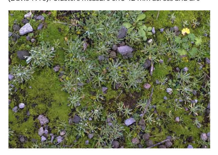
Overwintering (seedling) rosettes of Filago vulgaris at Baglan Bay, Neath Port Talbot.

Plants are often regularly branched above the middle of the main stem, forking into 2-3 branches below each cluster of capitula (Rose 2006; Stace 2010). Capitula ( 5 \times 1.6 mm) are in quite neat and dense \pm globose clusters of (15)20-c.40 (Davis 1975). Clusters measure c.10-12 mm across and are