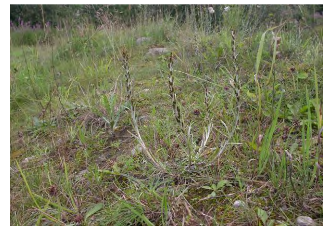
Gnaphalium sylvaticum near Kindrogan, Perthshire.

The leaves (2-8 cm long, 2-8 mm wide) are alternate, distinctly one-veined and often recurved at the tip. They are dull green and glabrous on the upper surface, and whitish or silvery grey-felted beneath (Poland & Clement 2009). The stalked lower stem leaves are lanceolate and pointed, and