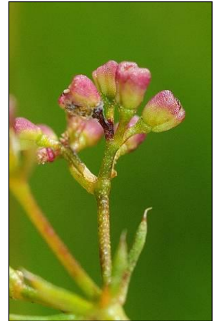
Right: Galium pumilum in fruit at Lydden

When the KBRG contingent arrived, however, the plant had gone to fruit and although we all traversed the spot painstakingly, it was a long time before the foliage was spotted, confined to an area of about 2 x 2 metres. We noted the survey details sought for the BSBI's Threatened Plant project, including the flora to be found within 1 metre of a target plant of the Galium – there were 17 other species, including Genista tinctoria (Dyer's Greenweed) which was plentiful along many parts of the chalk downland slopes.