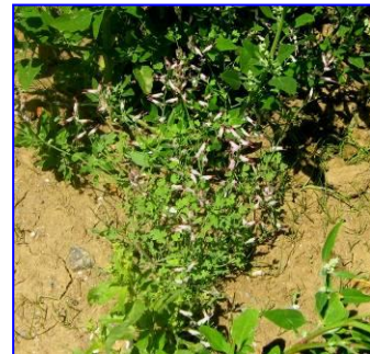
Right: Fumaria reuteri by the A229