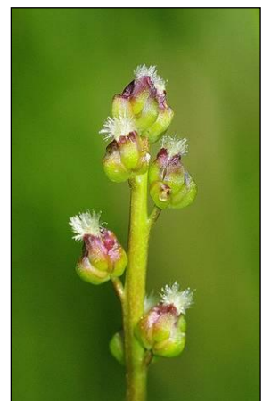
Right: Triglochin palustris at Worth

Our route took us on footpaths from the village through fairly intensive agriculture and beside dikes and ditches of varying botanical interest. Sue had previously obtained permission for the group to explore some of the farm fields which are not accessible to the public and in one of these a herd of cattle luckily remained at the far side long enough for us to enter and record from a muddy ditch the following 4 species for the rare plant register: Triglochin palustris (Marsh Arrowgrass), Potamogeton coloratus (Fen Pondweed), Juncus subnodulosus (Blunt-flowered Rush) and Utricularia vulgaris (Greater Bladderwort).