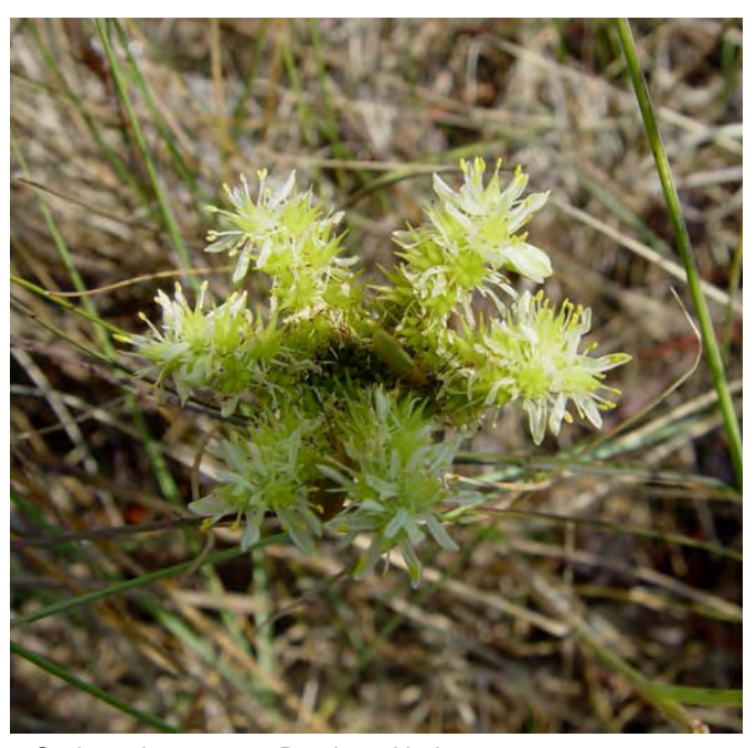
Sedum nicaeense at Pembrey Harbour

We arranged to visit the attenuation lagoons and irrigation ponds at Ffos Las racecourse on Wednesday morning where Eleocharis uniglumis was found in a monospecific stand juxtaposed with stands of E. palustris, affording an opportunity to compare the jizz of these two uniglumis being much more delicate and a much lighter, yellower green in contrast to the greygreen, more robust stems of palustris. The E. uniglumis was a new tetrad record and the furthest VC record from the coast (about 4km from the plants seen by members of the 2008 Glynhir meeting at Banc-y-Lord). Walking back to the cars after our picnic, Kath photographed a very attractive lucerne which, in the evening, Graeme identified from the photos as Medicago sativa nothosubsp. varia, the first VC record.