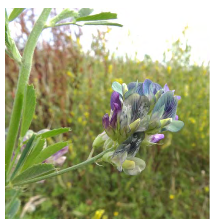
Medicago sativa nothosubsp. varia at Ffos Las