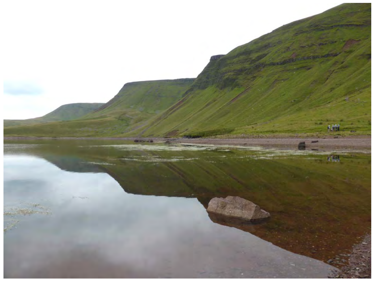
The party at Llyn-y-fan Fach.