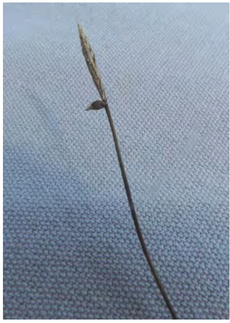
Carex dioica: left to right: female, male, forma isogyna (m. with f. at base)