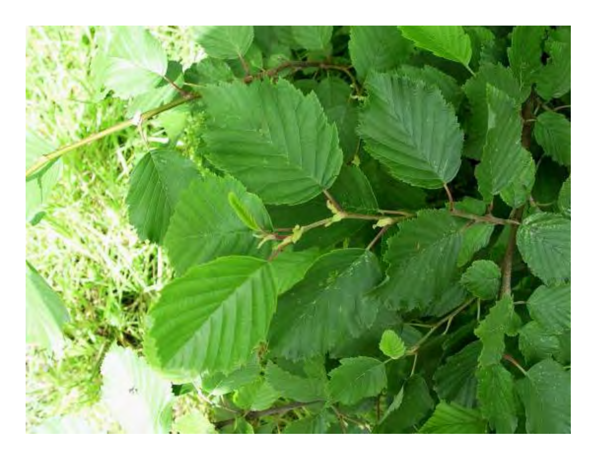
Alnus x hybrida