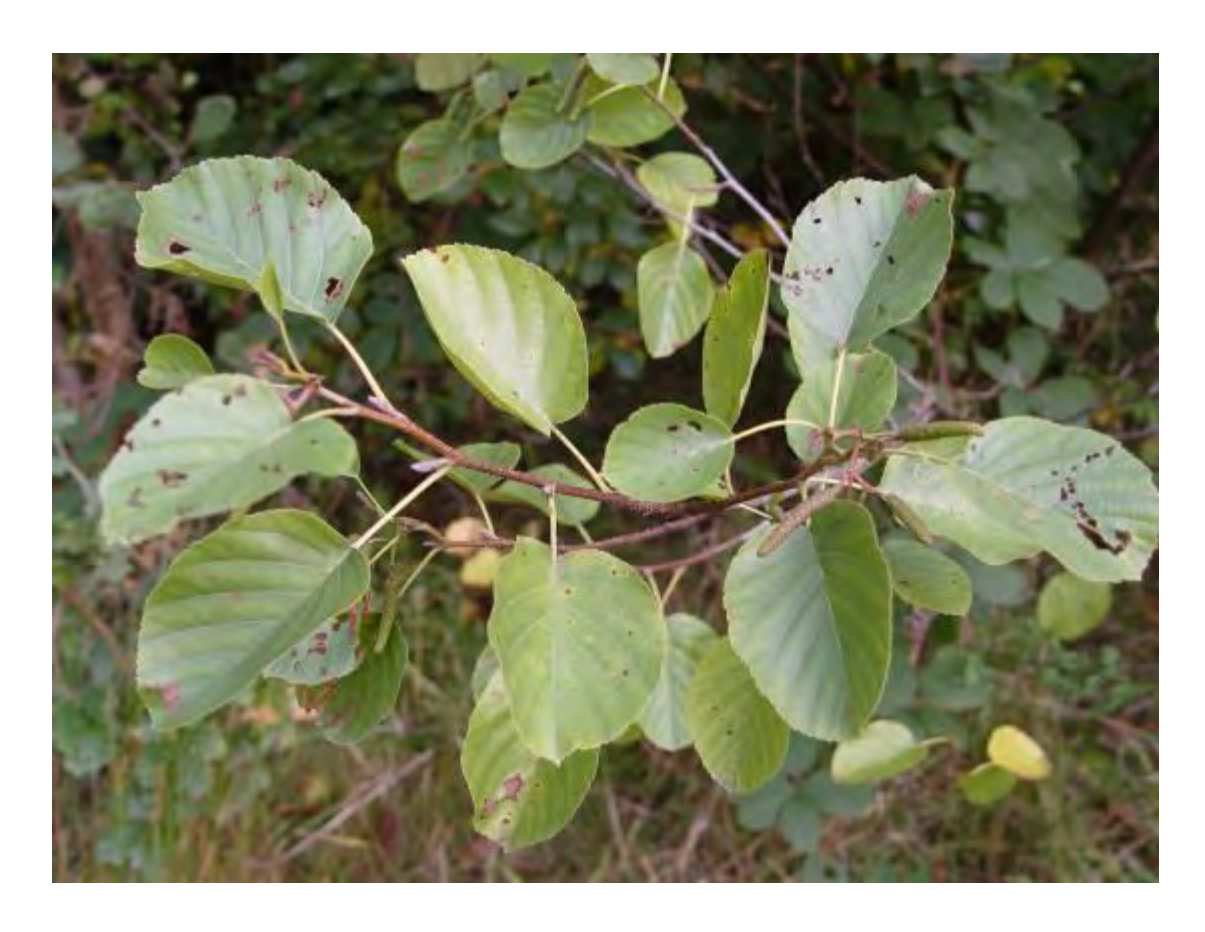
Alnus cordata x glutinosa at Ringway, new to Cheshire and second UK record.