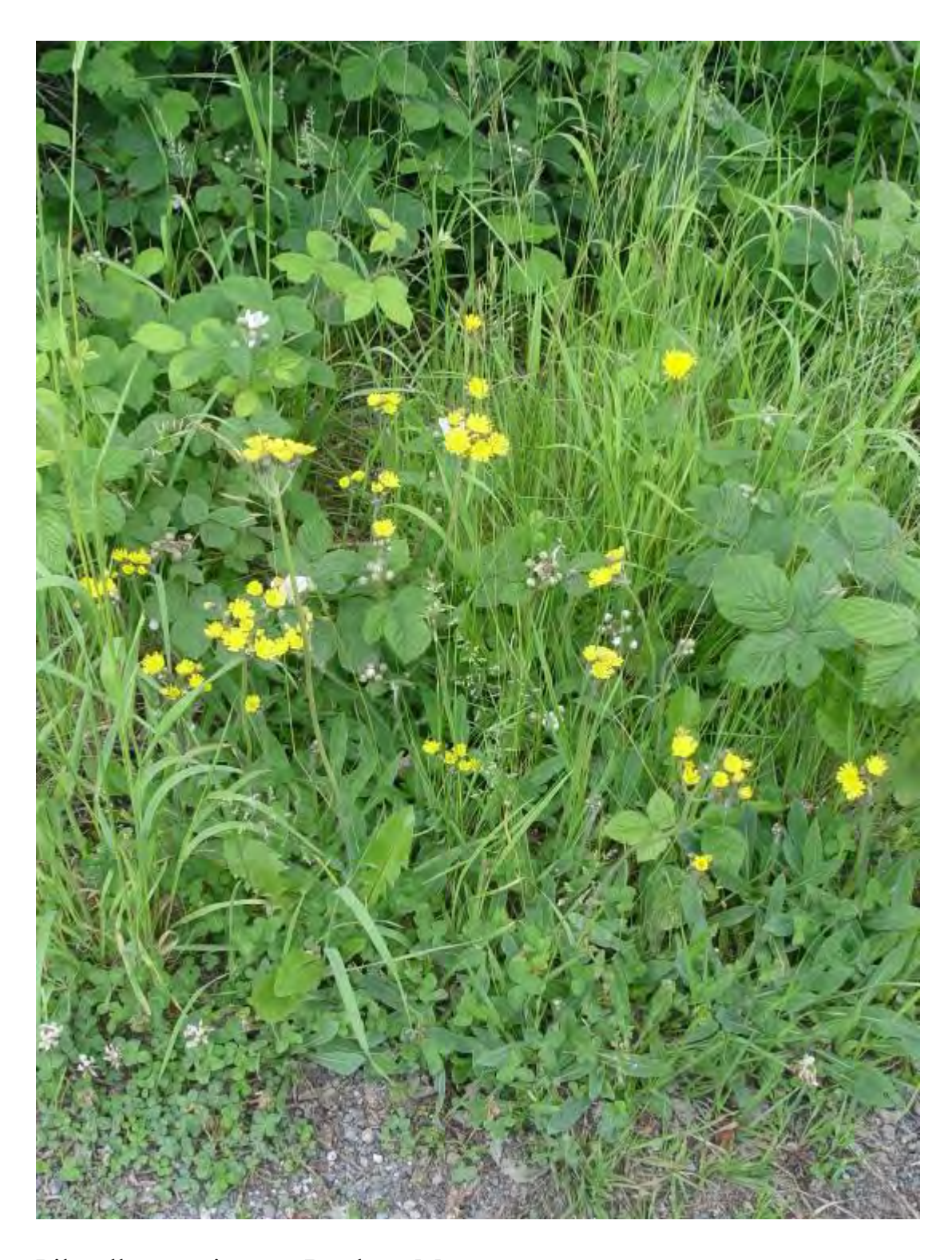
Pilosella caespitosa at Dunham Massey.