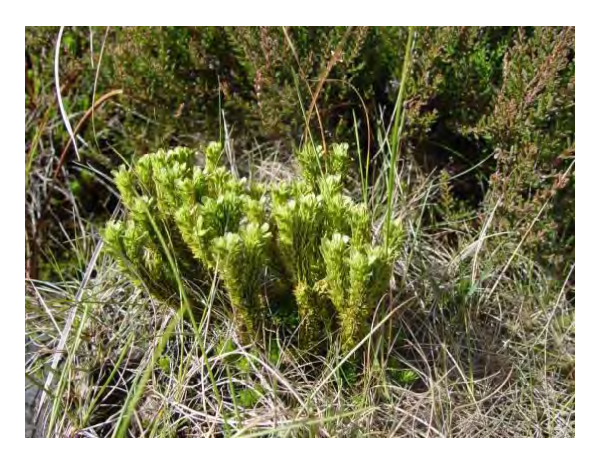
Huperzia selago on Shining Tor.